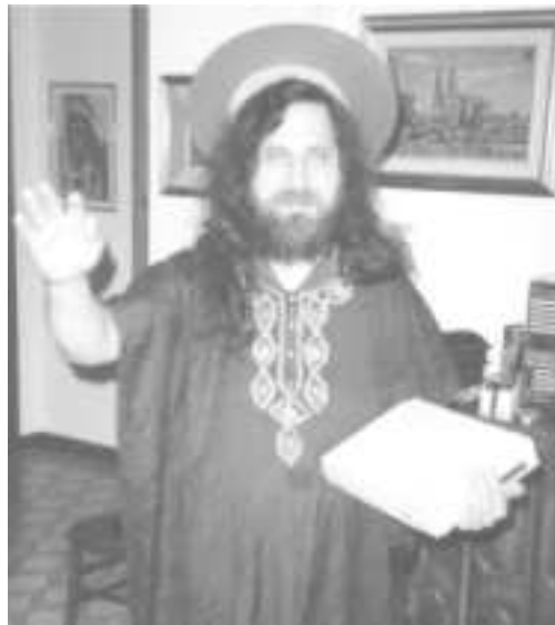
Figure 8.1: Stallman dressed as St. Ignucius.

the latest technological advancements, Stallman answers the question in terms of his own personal beliefs. "I think that freedom is more important than mere technical advance," he says. "I would always choose a less advanced free program rather than a more advanced nonfree program, because I won't give up my freedom for something like that. My rule is, if I can't share it with you, I won't take it."