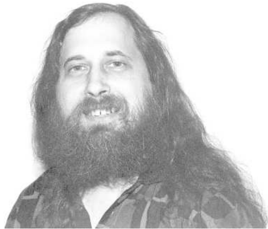
Figure 2.1: Richard Stallman, circa 2000. "I decided I would develop a free software operating system or die trying... of old age of course."

Before Uretsky can get another sentence out, Stallman is on his feet waving him down like a stranded motorist.